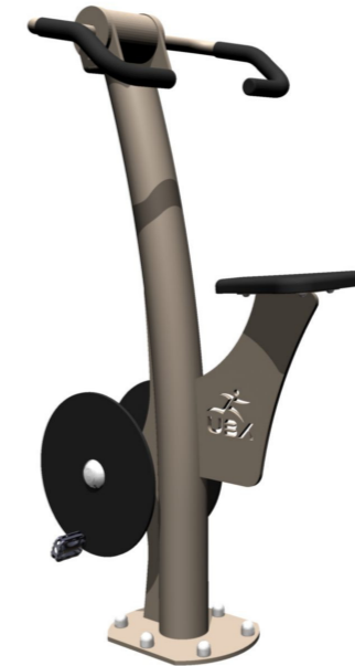
BICYCLE (RECUMBENT BIKE)